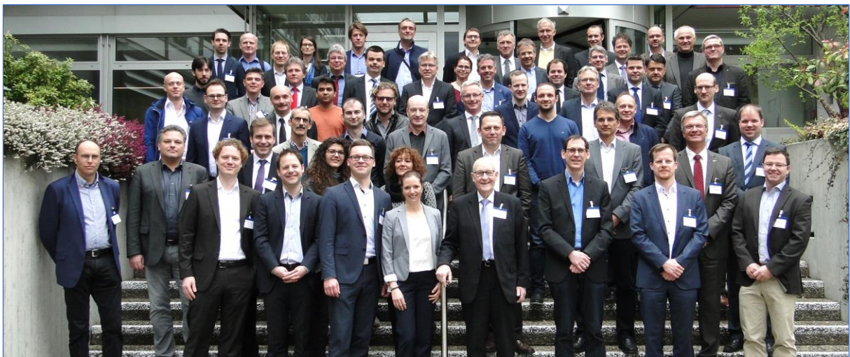
Participants of the OCM SpectroNet Collaboration Conference 2017, 21.03.2017, Karlsruhe

The SpectroNet Collaboration Conferences (SCC) are a series which are addressing customers as well as researchers, developers and application engineers. SCCs are connecting actively research & development, products & services, marketing & sales as well as education & training.